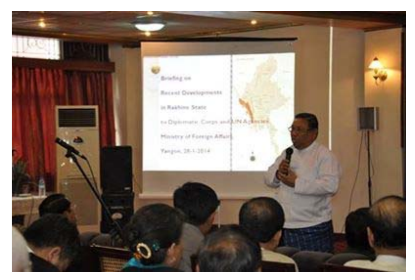
Union Minister for Foreign Affairs H. E. U Wunna Maung Lwin makes clarifications on incident in Rakhine State at the press conference held at the hall of the Ministry of Foreign Affairs in Yangon on 28 January 2014.

In addition, Union Foreign Affairs Minister U Wunna Maung Lwin said the government would release its investigation report, assuring that the investigation would be in transparency. He said that the government would arrange a trip for the diplomats to visit the area and a team led by the EU Ambassador would go to the area in the near future.