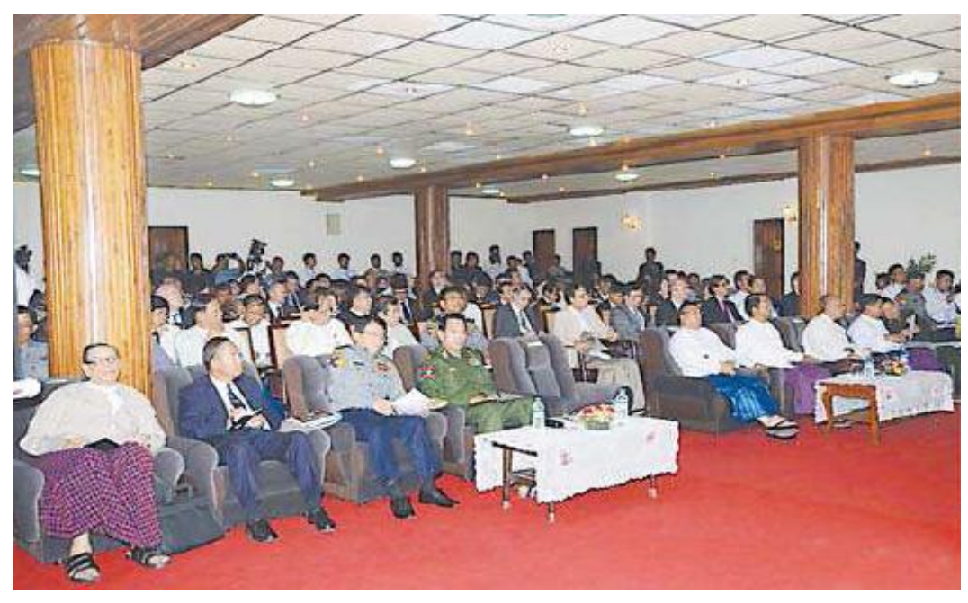
The press conference in progress at the Ministry of Foreign Affairs